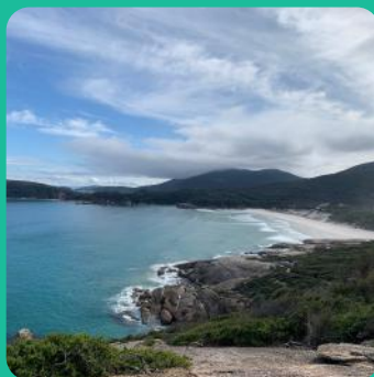
Parents & Friends