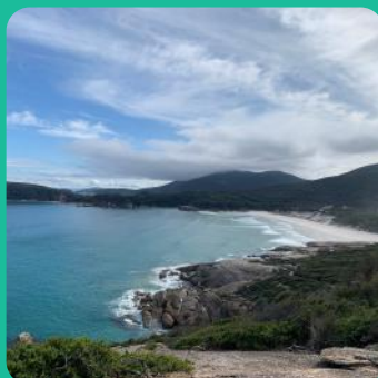
Parents & Friends